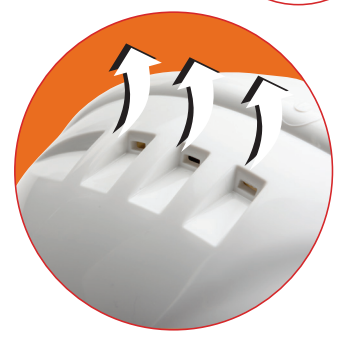
CoolSense™ Air Flow System on vented Serpent lets heat escape, keeping workers cooler.